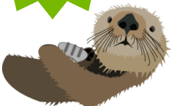
SEA OTTER BABY