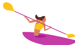
BIENVENIDOS A MONTEREY