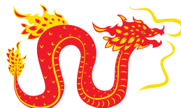
DEFENSE LANGUAGE INSTITUTE